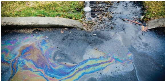
Driveway contaminants flow into nearby stormdrains.

The process of resealing driveways can also pollute water especially when coal tar or asphalt-based sealants are used. These types of sealants contain Polycyclic aromatic hydrocarbons (PAHs) at concentrations 65 times higher than unsealed driveways. PAHs can cause cancer in humans and animals. It can take months for PAHs to breakdown in soil and water. In that time, they can contaminate ground and surface waters.