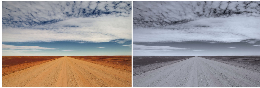
Figure 1 Comparison of HSV values. Right photograph has higher Hue (bluer), lower Saturation (grayer), and lower Brightness (darker) than left photograph. Instagram photos posted by depressed individuals had HSV values shifted towards those in the right photograph, compared with photos posted by healthy individuals.

of being personally identified, and assured them that no data with personal identifiers, including usernames, would be made public or published in any format.