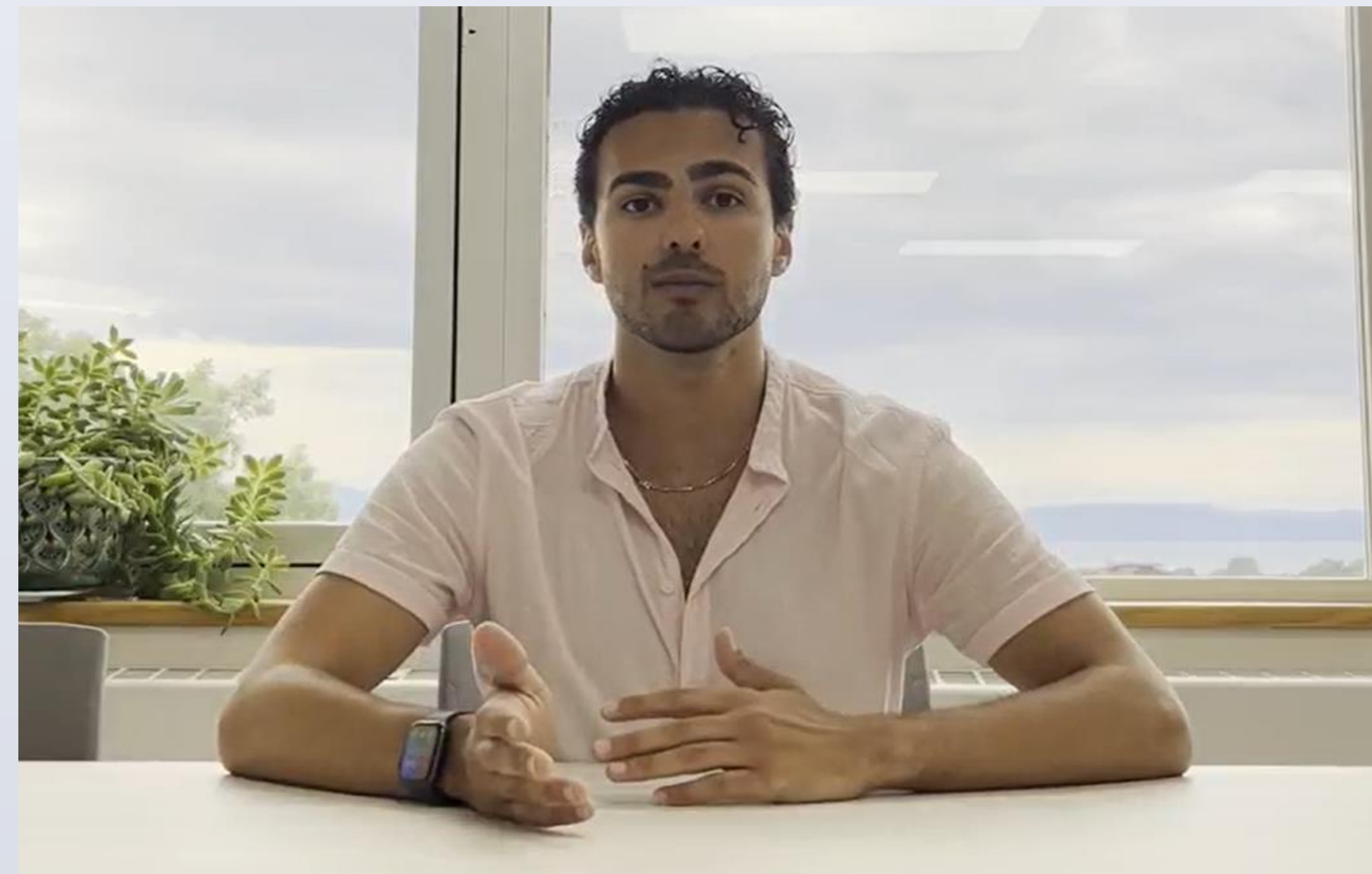
Screen capture from initial video series designed to be a short form video to be viewed from a smartphone