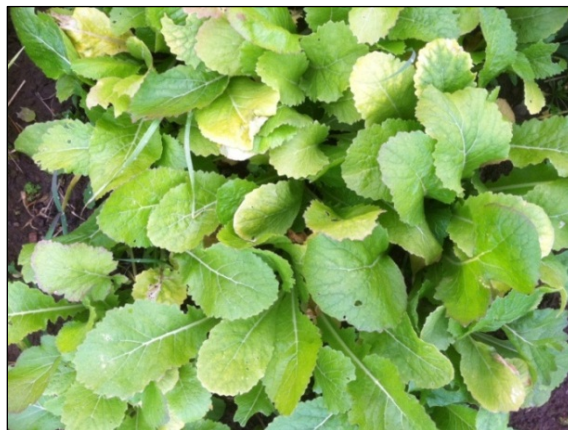
Figure 2. T-Raptor brassica hybrid.