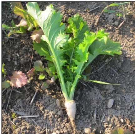
Figure 1. Appin turnip.