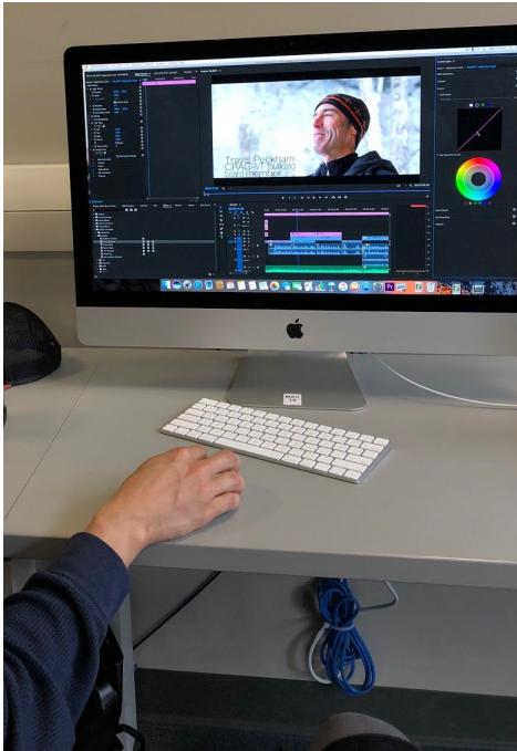
(Editing and editing and editing)

Climbing Gym on April 19th for the Spring Kick-Off, only a week after we stopped filming. I spent at least 15 hours just editing the 3-minute film and finished the final version on the day of the film premiere.