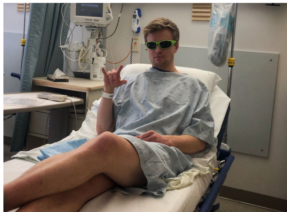
Right: (Day of surgery, mentally prepping).