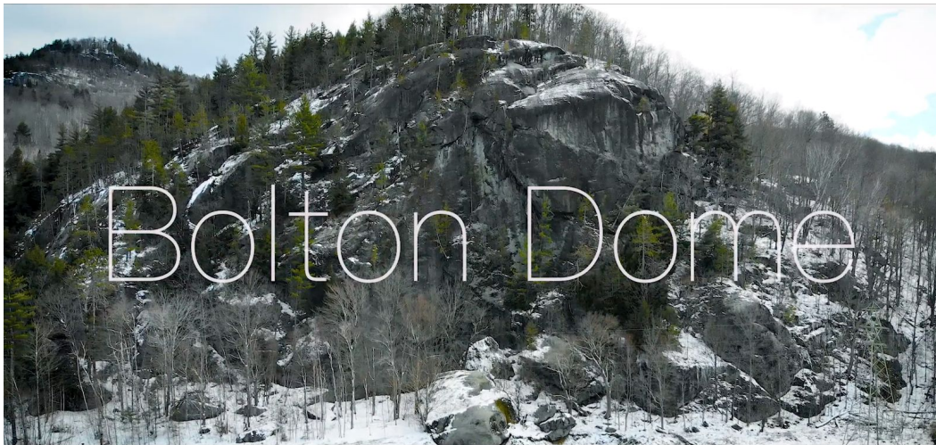
(Bolton Dome Climbing Area // Bolton, VT)

A friend recommend that I reach out CRAG-VT because they had recently purchased a new property in Bolton, Vermont, called Bolton Dome, and needed help repaying the loan they received from The Access Fund.