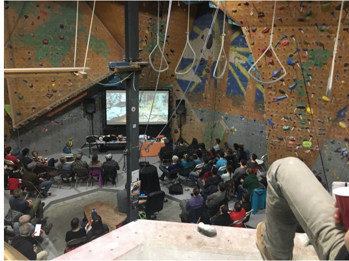
(A view from the crowd at the premiere)

The premiere had a turn out of about 100 people and received a strong applause, with endearing compliments after the film showed. What I was able to produce for CRAG-VT posed to mutually beneficial for both the organization and myself. For me, I gained valuable experience in the field, directing my first serious (short) film with major actors. It was a strong learning experience and helped me gain confidence as a young film producer. I also utilized and developed my communication skills through constant correspondents with all of the players involved in the film, especially CRAG-VT's social media director, whom I corresponded with daily about edits and critiques for the film. Finally, in producing this project I applied many of