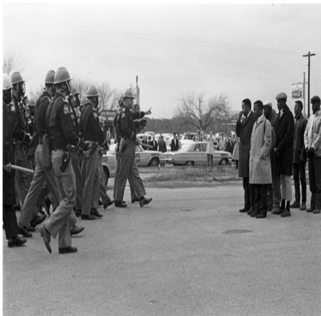
“Two Minute Warning”

March 7, 1965