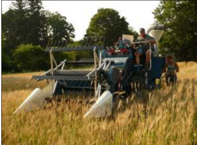
Image 2. Spring wheat variety trial harvest, Alburgh, VT, 2016.

Mill. At this time flour was evaluated for its protein content, falling number, and mycotoxin levels. Grains were analyzed for protein content using the Perten Inframatic 8600 Flour Analyzer. Grain protein affects gluten strength and loaf volume. Most commercial mills target 12-15% protein. Protein was calculated on a 12% moisture. The determination of falling number (AACC Method 56-81B, AACC Intl., 2000) was measured on the Perten FN 1500 Falling Number Machine. The falling number is related to the level of sprout damage that has occurred in the grain. It is measured by the time it takes, in seconds, for a stirrer to fall through a slurry of flour and water to the bottom of the tube. Falling