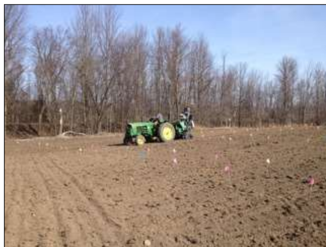
Image 1. Seeding spring wheat variety trial, Alburgh, VT, 2016.

Following harvest, seed was cleaned with a small Clipper cleaner (A.T. Ferrell, Bluffton, IN). An approximate one pound subsample was collected to determine quality. Quality measurements included standard testing parameters used by commercial mills. Test weight was measured by the weighing of a known volume of grain. Generally the heavier the wheat is per bushel, the higher baking quality. The acceptable test weight for bread wheat is 56-60 lbs per bushel. Once test weight was determined, the samples were then ground into flour using the Perten LM3100 Laboratory