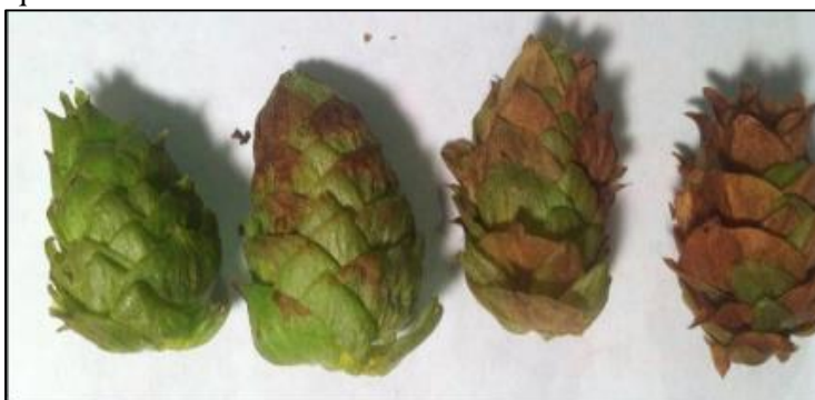
Image 1. Cones infected with alternaria, fusarium, and downy mildew

cones. Nugget is susceptible to downy mildew, and Cascade is moderately resistant. Fusarium was not found on Nugget cones, but was found in small quantities on Cascade cones.