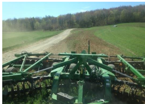
Figure 3. Vertical tillage.