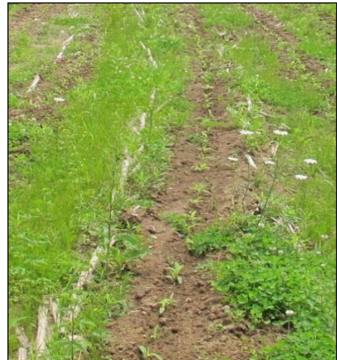
Figure 1. Strip tillage.

Minimum tillage practices have significant potential to reduce expenses and the potential negative environmental effects caused by intensive tillage operations. Conventional tillage practices require heavy machinery to work and groom the soil surface in preparation for the planter. The immediate advantage of reduced tillage for the farm operator is less fuel expense, equipment, time, and labor required. It's also clear that intensive tillage potentially increases nutrient and soil losses to our surface waterways. By turning the soil and burying surface residue, more soil particles are likely to detach from the soil surface and increase the potential for run off from agricultural fields. Reducing the amount and intensity of tillage can help build soil structure and reduce soil erosion.