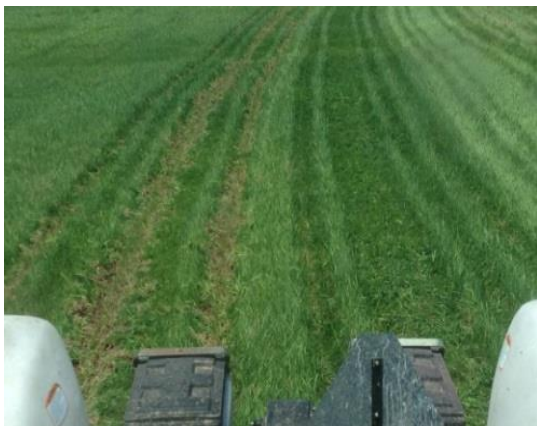
Figure 2. No-Till Corn Planting.

Many growers are interested in a variety of minimum tillage strategies including 'strip-till,' 'no-till,' and 'vertical-till.' Strip tillage cultivates a 4-6" strip of soil along both sides of the planted row (Figure 1). Strip tillage allows the soil in close proximity to the seed to dry out and warm up faster than it would without tillage. It also deeply tills the soil (8-10 inches) where the crop is planted. No-till (Figure 2) implements do not till the soil, but rather use metal coulters to cut the soil and plant seed into the slot created by the coulters (disk openers). An attachment on the back of the planter closes the slot and maximizes seed to soil contact to facilitate germination. This can be done in a variety of ways. Some systems use a heavy press wheel, while others use spiked wheels or even rubber wheels to perform this critical action. The type of wheel selected will depend on soil types and conditions so may vary from farm to farm. Vertical tillage (Figure 3) is a tillage system, which lightly tills the top 2-3 inches of the soil, preparing a smooth seedbed without introducing tillage pans into the soil profile. Vertical tillage equipment is developed to run shallow and fast over the field sizing and anchoring residue while