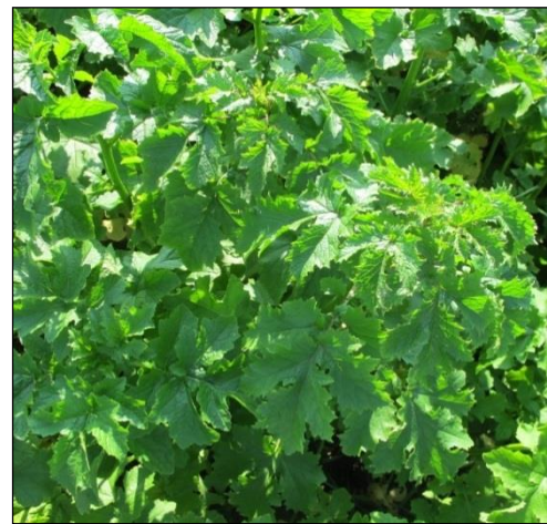
Figure 1. Appin turnip just before harvest.

In 2015, a variety trial was conducted at Borderview Research Farm in Alburgh, VT, in order to evaluate twelve forage brassica varieties (Table 1, Figure 1). Seven brassica varieties had been grown successfully in previous trials, and five additional brassica varieties were added to this year's trial.