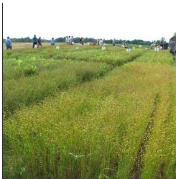
Figure 1. Flax plots on 1-Aug, Alburgh, VT.

NS – No significant difference amongst varieties.