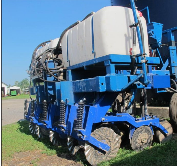
Figure 1. Penn State Cover Crop Interseeder and Applicator.

Sunflowers were planted in 30” rows on 31-May with a John Deere 1750 MaxEmerge corn planter fitted with shorter sunflower fingers. The variety Cobalt II (Seeds 2000) was planted at 34,000 viable seeds per acre. To establish the interseeded crops, an implement was borrowed from Pennsylvania State University, which has the capability to both seed cover crops and apply nutrients simultaneously (Figure 1). Crops were interseeded on 13-Jul, later than ideal, but as early as soil conditions would allow. Normally interseeded crops would be planted closer to the main crop’s planting date, to become established before the main crop and successfully compete with early-season weeds.