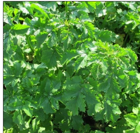
Figure 1. Appin turnip just before harvest.

In 2012, a variety trial was initiated at Borderview Research Farm in Alburgh, VT, in order to evaluate four forage brassica varieties (Table 1, Figure 1).