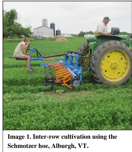
Image 1. Inter-row cultivation using the Schmotzer hoe, Alburgh, VT.

Grain plots were harvested with an Almaco SPC50 plot combine on 23-Jul, the harvest area was 5’ x 40’. At the time of harvest, plant heights were measured, excluding the awns, in inches. Lodging was recorded by a visual estimate of percent lodged plants and the severity of lodging based on a visual rating with a 1 – 5 scale, where 1 indicates minor plant lodging and wheat could still be combined, and 5 indicates severe lodging and a complete crop loss. In addition, grain moisture, test weight and yield were calculated.