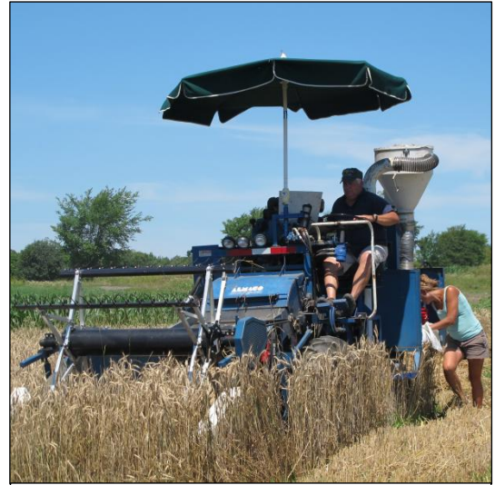
Image 2. Winter wheat N topdress trial harvest, Alburgh, VT.

The treatments differed significantly in yield (Table 4; Figure 1). The highest yielding treatment was 70lbs ac -1 of Chilean Nitrate applied at spring greenup (GS25) with 3845lbs ac -1 . The unamended control treatment (2244lbs ac -1 ) yielded less than Chilean Nitrate treatments applied at GS30 GS25 at the 70 and 35 lbs ac -1 . Interestingly, there were no significant differences in grain moisture and test weight. The treatments differed in protein concentration (Table 4; Figure 2). ‘Pro-Booster’ treatments and Chilean Nitrate applied at both GS25& GS30 stages had the highest protein levels. Fall manure applications and the unamended control treatments did not differ in CP concentrations. Interestingly, the protein level of ‘Chilean Nitrate’ applied at GS25 was not significantly different than the fall applied manure or the unamended control plots. The average protein level was 11.5%. Treatments did not differ significantly in falling number or DON.