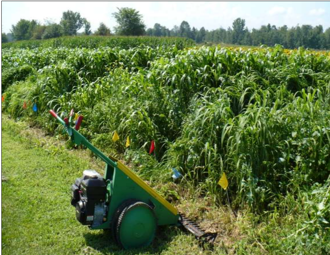
Image 1. Summer annual variety trial.