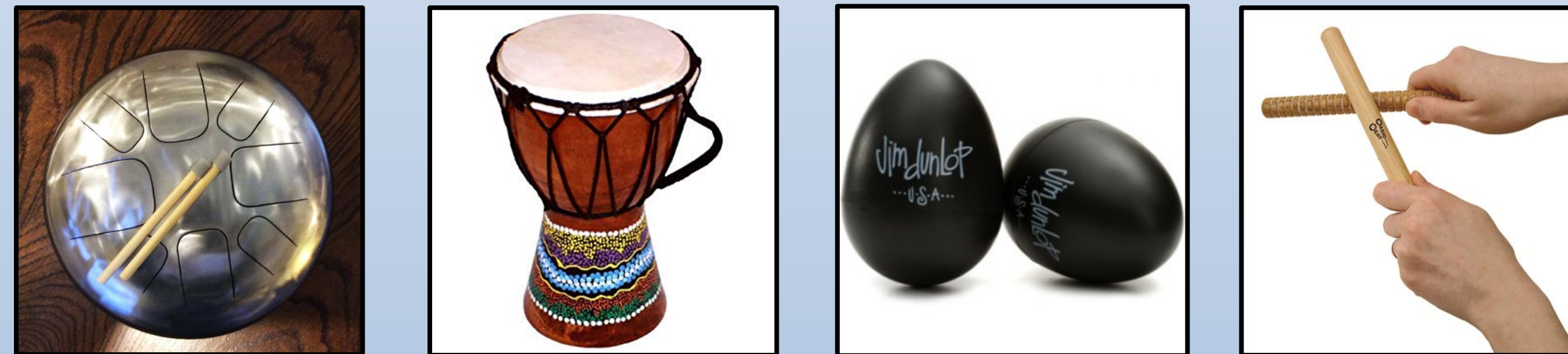
Figure 2. Different tools used during the sessions. Singing drum, African drum, egg shakers, rhythm sticks (left to right). Representative images were collected from google images: "Vermont Singing Drum", "World Playground Djembe Drum", "Dunlop Eggshaker", "Basic Beat Combination Rhythm Sticks." (left to right)