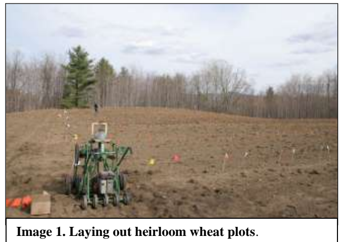
Image 1. Laying out heirloom wheat plots.