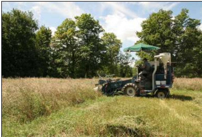
Image 2. Heirloom wheat harvest