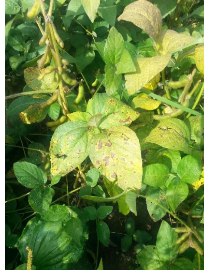
Image 2. Bacterial blight on soybean leaf.

Soybeans were harvested on 20-Oct, harvest results are shown in Table 6. Despite wet weather through most of the season, soybean yields were quite high this year ranging from 2285 to 4296 lbs ac -1 which equate to 38.1 to 71.6 bu ac -1 . Fourteen of the 23 varieties in the trial yielded greater than 60 bu ac -1 . The highest yielding variety was S20-T6, which yielded 71.6 bu ac -1 . This was statistically similar to eight other varieties (Figure 1). Test weight ranged from 52.3 to 59.8 lbs bu -1 . All varieties except for two, produced beans with test weights that were statistically similar to the top performer, SG1055. None of the varieties trialed reached the target test weight for soybeans which is 60 lbs bu -1 . This may have been due to weather conditions during pod development and seed fill. Plant populations also varied statistically. The highest population of 172,304 plants ac -1 was observed in variety S18XT38 which was similar to nine other varieties. Interestingly, the highest yielding variety had one of the lower plant populations of 149,072 plant ac -1 .