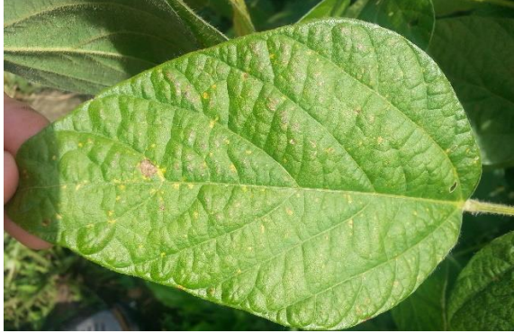
Image 1. Downy mildew on soybean leaf.