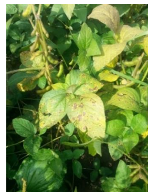
Figure 1. Bacterial blight

Varieties did not statistically differ in harvest moisture or test weight. All varieties were above 18% moisture and required drying prior to storage. None of the varieties reached the standard test weight of 60 lbs bu -1 . The highest test weight was 55.0 lbs bu -1 and the average for the trial was 54.3 lb bu -1 . This was likely due to the lack of moisture throughout the season, especially during seed fill. Oil content ranged from 6.83 to 16.2% and averaged 9.98% across the trial. However, as these oil contents did not vary statistically neither did oil yields. Very little disease or insect pressure was observed throughout the season. Very low populations of Japanese beetles and flea beetles were documented and minimal damage was observed on soybean leaves. Very low incidence of Bacterial blight ( Pseudomonas syringae pv. glycinea ) was recorded on lower leaves of the soybeans (Figure 1).