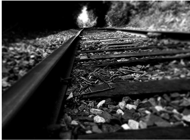
Figure 4: Rail Road Tracks