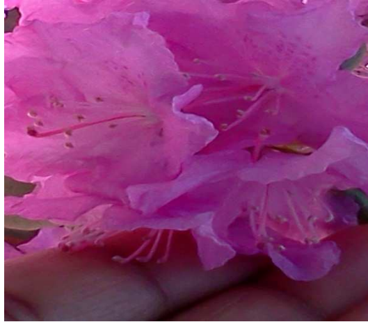
Figure 2: Pink Flower Photo