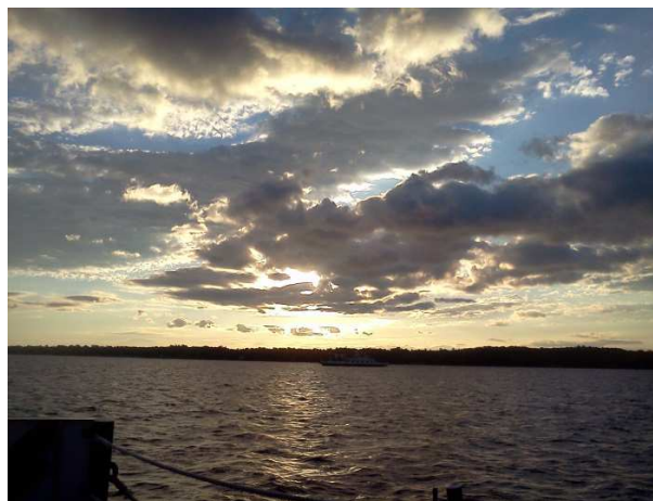
Figure 1.1 The Cruise Boat on Lake Champlain

I think my subconscious and my innermost piece of me needed to really see what a great opportunity I would be missing out on right in front of me. And something came over me, I went straight to my first 10,000 word SPN manuscript done in December 2013 named: “Title Less, Could This Truly Be Me: Mocha Coca Chocolate of Mindless Creativity”. I remembered three points that helped me make one huge life changing decision I made to still keep on going on professionally in my academic career. One main point was Maya Angelou’s poem Still I Rise, which goes as follows: