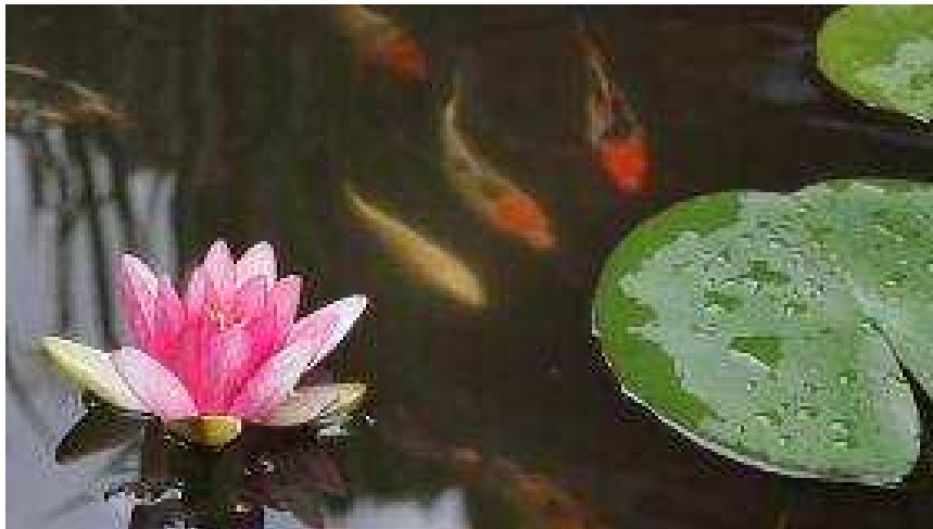
Figure 1.3: Pink water lily with orange fish photo

Now is the time, nothing or no one can or should stop you or me.