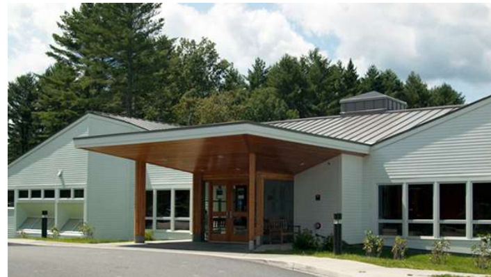
The Health Center – 2019