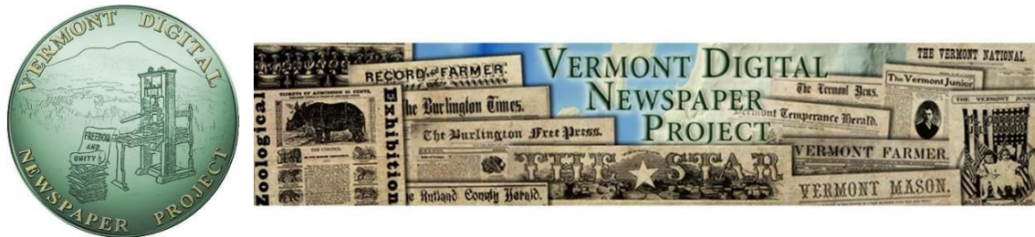
Figure 3 VTDNP Logo and Banner designed by K. Heather Kennedy

On the Internet, VTDNP has a website xiv , WordPress blog xv , and Facebook page xvi . The project also created a branding package that included a logo, banner, and VTDNP bookmark (see figure 3 below) to accompany Chronicling America bookmarks produced by LC.