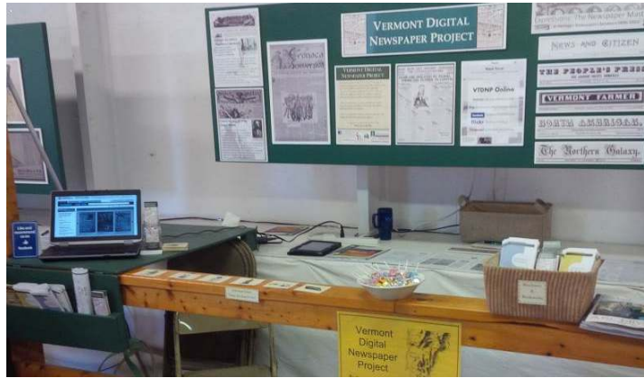
Figure 5 – VTDNP booth at the Vermont History Expo 2014. Displays include print outs of digitized newspaper mastheads, lesson plans, brochures, bookmarks, online access to Chronicling America , a guessing game involving old toys ads, and candies.