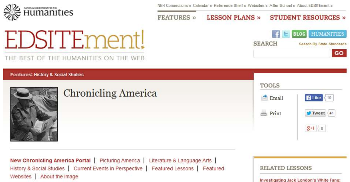
Figure 2 – Chronicling America Feature page on NEH’s EDSITEment! Website

America, Literature and Language Arts, History and Social Studies, Current Events in Perspective, Featured Lessons, and Featured Websites ( see figure 2 below ).