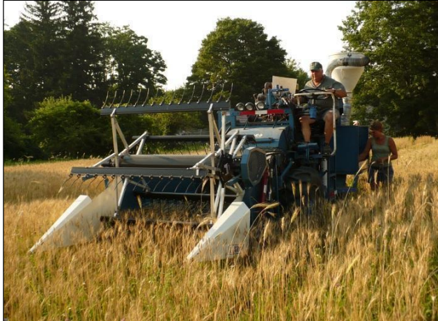
Image 1. Spring wheat variety trial harvest, Alburgh, VT.

Samples with DON values greater than 1 ppm are considered unsuitable for human consumption. DON analysis was on one replication to see the general level present.