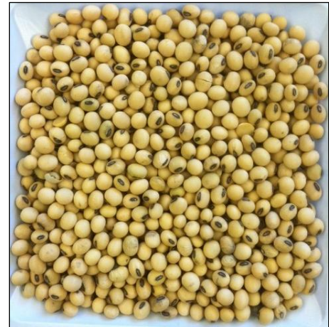
Figure 1. Dark-hilum soybeans.

In 2012, an organic soybean variety performance trial was conducted at Borderview Research Farm in Alburgh, VT. Several seed companies submitted varieties for evaluation (Table 1). The soybean varieties were considered early maturing, with maturity groupings between 0.6 and 1.9. Both dark hilum and light or clear hilum varieties were included in the study (Figure 1). Light hilum varieties are typically grown for foodgrade uses, since the dark hilum can stain food and oil products and render yields unmarketable. Both types can be used for livestock feed, and food-grade soybeans that do not meet standards often become feed.