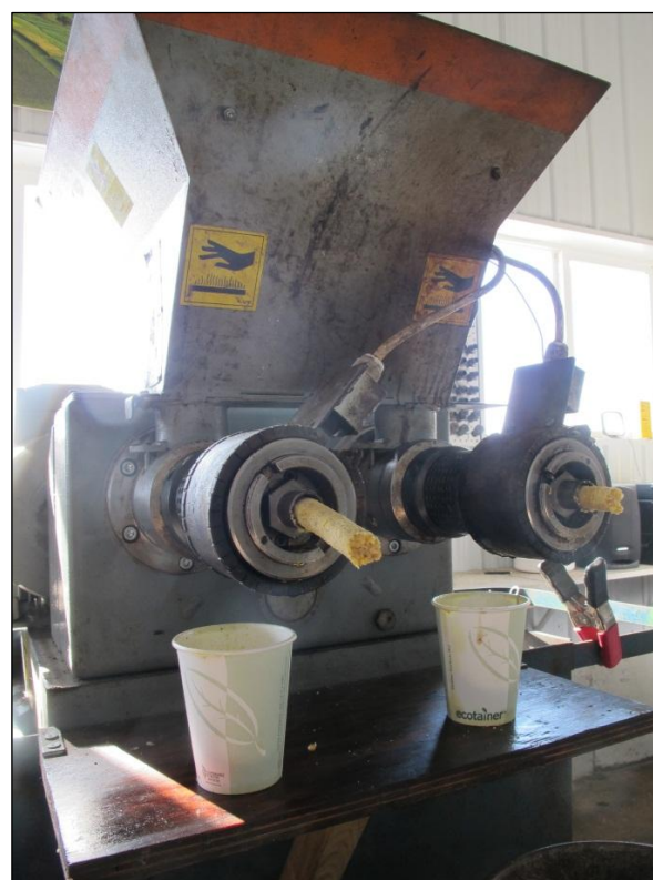
Figure 2. Kern Kraft KK40 press used for soybeans.

On 29-Nov, subsamples from each plot were pressed with a Kern Kraft KK40 oil press (Figure 2). The press was fitted with “hard seed screws” and operated at a constant high temperature (175° F) and approximately 45 RPM. Oil content was calculated based on seed sample weight and final oil weight.