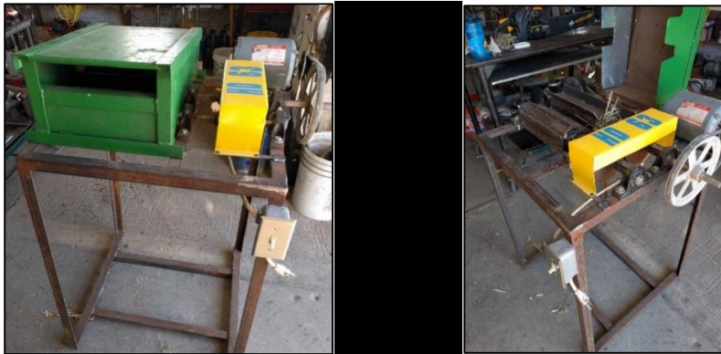
Image 1. Custom built decorticator, Alburgh, VT, 2017.

Prior to planting on 24-May, the trial plots received 200 lbs ac -1 7-18-36. Fertility amendments were based on soil test result. On 24-May, plots were seeded with a Great Plains NT60 cone seeder, and on 7-Jun, plant emergence populations were recorded by counting the number of plants in a foot-long section of the row, two times per plot. From 19-Jul to 11-Aug, in accordance with full flowering, five randomly selected plant heights and stem diameters were extracted from within each plot prior to mowing. During the same time, wet weight harvest yields were calculated by sampling the hemp biomass within a 0.25 m 2 quadrat. Harvest moisture was calculated by taking a subsample of hemp biomass and drying it at 105° F until it reached a stable weight. On 3-Aug and 4-Aug, five plants were selected at random from each plot and run through a custom-built decorticator (Image 1). While the stalks were still fresh, they were weighed and decorticated to separate the bast and hurd fibers. As the stalks passed between the two moving gears, hurd fiber broke away and dropped to a bucket placed underneath. The bast and hurd were weighed to determine ratios and varietal differences.