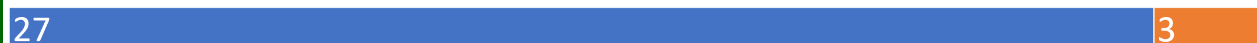
Figure 2: Proportion of authors (n=30) of APSO note templates who express satisfaction, neutrality, or dissatisfaction with the template