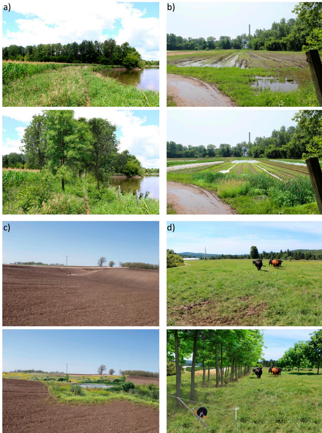
FIG. 1. Four “existing and proposed” PVZ posters displayed at the conference table where surveys were distributed and collected: (a) riparian buffers, (b) drainage tiles with constructed wetlands, (c) retention ponds, and (d) silvopasture.

obtained prior to survey deployment [Committee on Human Research in the Behavioral Sciences (CHRBS): B13–180]. The survey was reviewed and revised by several researchers with relevant expertise from outside