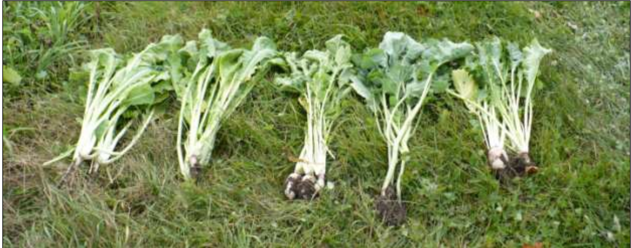
Figure 2. Brassica varieties from left to right; T-raptor, Pasja, Barkant, Bonar, Appin.