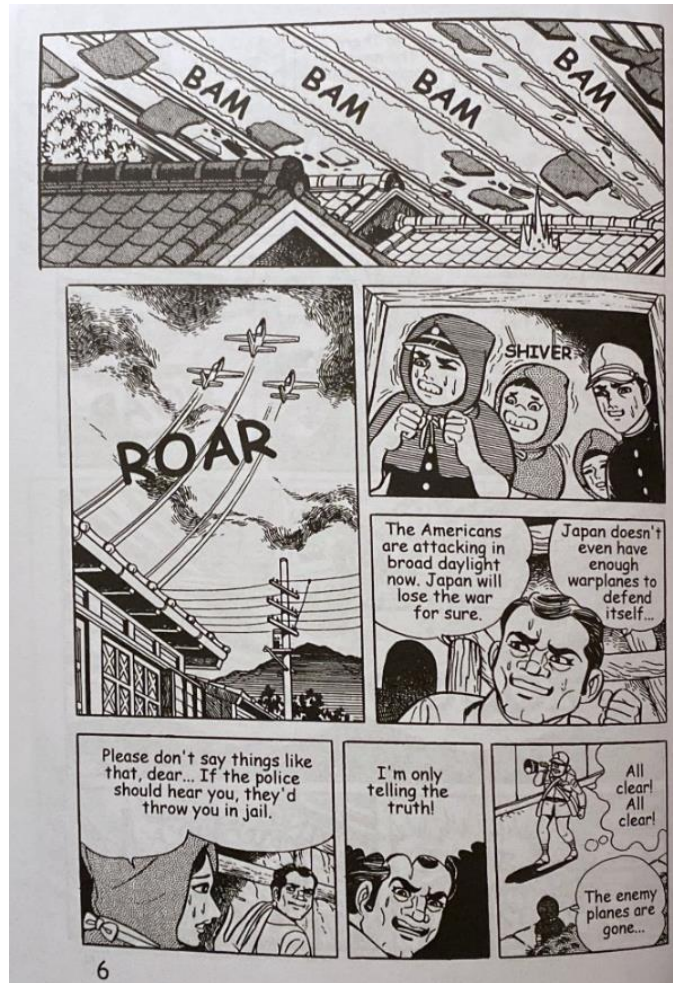
Figure 1. (Nakazawa, Barefoot Gen Volume 1: A Cartoon Story of Hiroshima , 1: 6)

unfathomable as the atomic bombing. The use of realistic gore and violence contrasts the otherwise friendly and exaggerated character designs, making it more shocking.