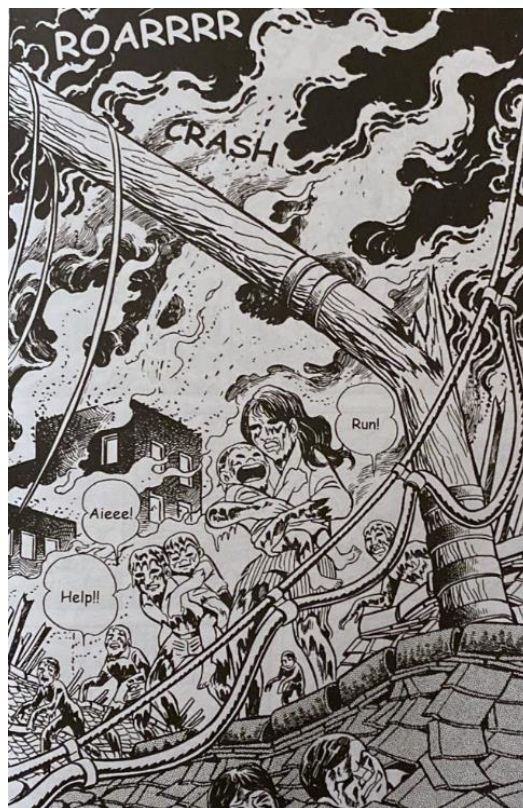
Figure 2. (Nakazawa, 1:271)

known materials that capture these scenes, as most photos date to several days and weeks afterward. Thus, art has become the sole medium for conveying the surreal violence of the bomb, with Nakazawa's Barefoot Gen being a widely recognized example. 42 To achieve his goals of memorializing the bombing, Nakazawa uses immediately readable and recognizable violence to ensure accurate remembrance. After the publication of his earliest atomic bomb works, Nakazawa frequently received letters from readers in disbelief of the reality of these scenes. 43 Nakazawa's art did not just show the world what had happened but proved and validated the painful experiences of survivors. Highlighting the distinctiveness of the bombing and its uniquely violent nature is a common theme in first-generation hibakusha storytelling.