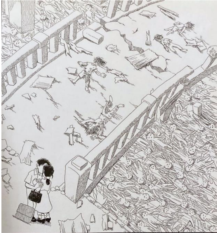
Figure 4. (Kōno, 22)

Transformations in art style also distinguish Nanami's father Asahi's flashbacks from the contemporary plot in the second part of Town of Evening Calm, Country of Cherry Blossoms . The contrast is less significant, but the inking and lines become noticeably lighter and thinner, creating an effective visual indication of scene transition. This is immediately recognizable in his first flashback, where we see an older Asahi sit on a riverbank transform into his younger self on the next page. In a prior scene, dark, filled in spaces can be seen on clothing and hair, but following the transition, these darker spots are replaced with lighter cross-hatching, making the scene detached from the reality just shown. 44 In This Corner of the World also utilizes shifts in art style to convey significant moments. Though there are no flashback scenes, radical changes in