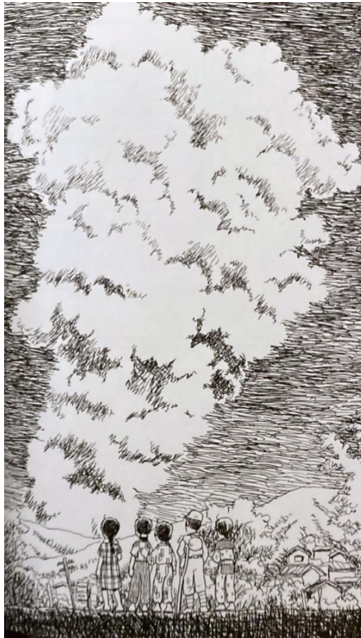
Figure 5. (Kono, In This Corner of the World , 364)

styling can be seen in Suzu's drawings, 45 which reflect recent thoughts and events, and scenes of warfare and violence. The most pertinent example of the latter is the depiction of the Hiroshima explosion, where the stark white and visually dominating form of the cloud is accentuated by a background darkened by dense cross-hatching (see fig. 5). In This Corner of the World primarily uses white space and simple outlines of surroundings, so the sudden darkening of the background makes the moment shocking. This technique is a reverse of the art style shifts utilized in Town of Evening Calm, Country of Cherry Blossoms , giving it the effect of heightening the scene's realism and grounding the events of the story firmly in wartime violence.